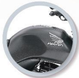
Matt. Axis Grey Metallic