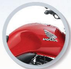
Imperial Red Metallic