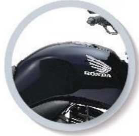
Pearl Siren Blue