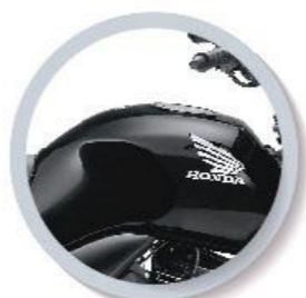
Pearl Igneous Black